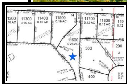
Lot #15 – 4732 Jessen Drive