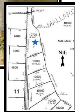
Lot #7 – 2270 Blue Heron Ln